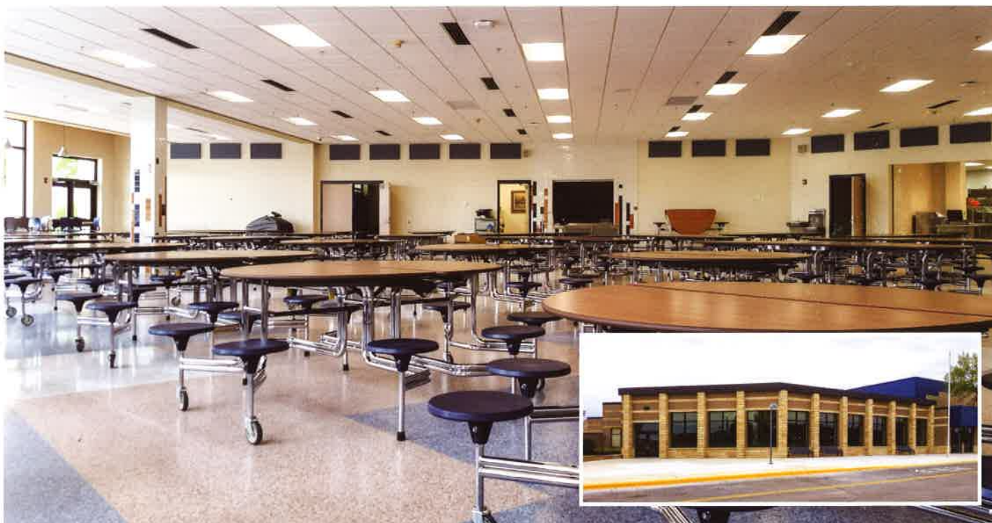
Above: The new dining room space will easily accommodate the addition of the new sixth grader class. Inset: An exterior view of the expanded cafeteria and entrance.